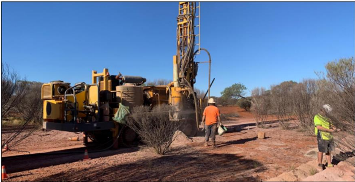
Figure 1 - RC Drilling underway at BPM's Hawkins Lead-Zinc Project.